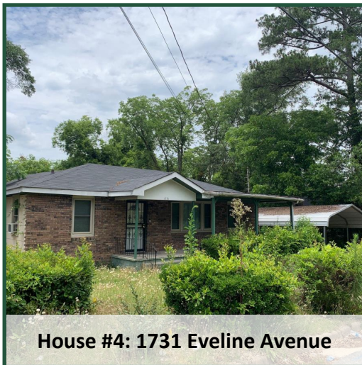
House #4: 1731 Eveline Avenue