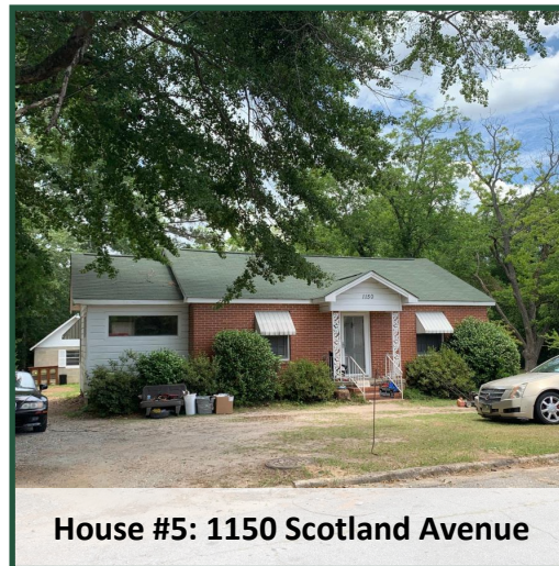
House #5: 1150 Scotland Avenue