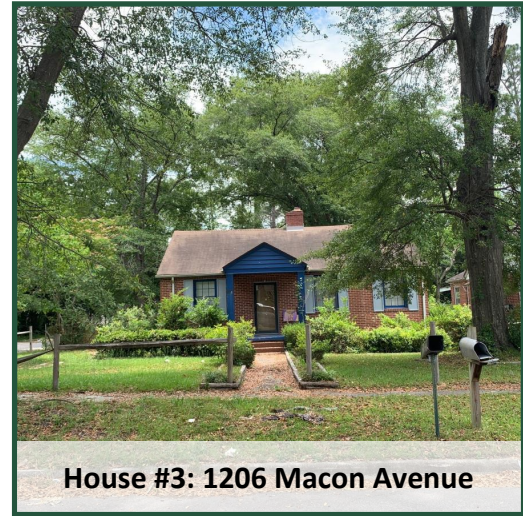
House #3: 1206 Macon Avenue