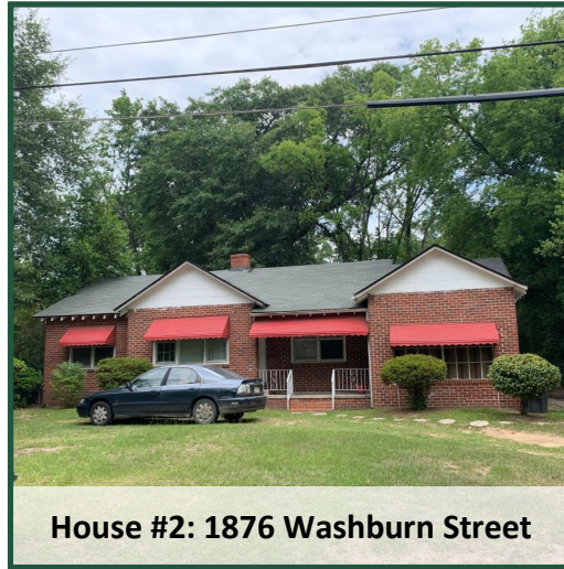
House #2: 1876 Washburn Street