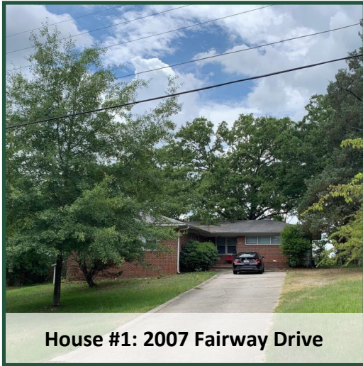
House #1: 2007 Fairway Drive